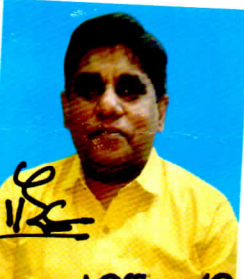
Sr. Personnel Officer (Con.) East Central Railway, Mahendrughat, Patna

Photograph, Specimen signature and LTI is as under :-