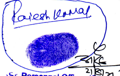
Sr. Personnel Officer (Con.) East Central Railway, Mahendrughat, Patna