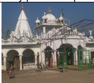
सिंहेश्वर स्थान मधेपुरा

With district headquarters at Motihari. " Ashoka Stambha " of King Ashok era is worth seeing at Areraj, Gandhi Memorial Statue and Museum at Motihari. Raxaul entry point of Nepal is also situated in this District.