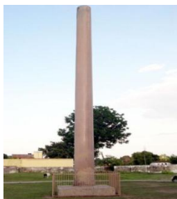
अशोक स्तम्भ अरेराज