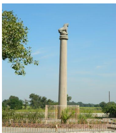
अशोक स्तम्भ, लौरिया