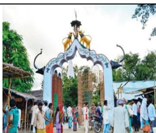
कात्यानि मंदिर धमाराघाट

It is a famous pilgrimage of lord Mahadeo in the country. It is situated at a distance of 8 km from Madhepura and about 30 Km from Saharsa Station and is renowned for its historical and religious importance. Here Devotes not only from Bihar but also from other parts of the country including the neighboring country Nepal come to singheshwar sthan for the worship of lord Shiva. Mahashivratri mela of singheshwar sthan is famous in Bihar and Nepal also.