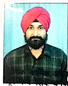
L. C. No. Dhanbad